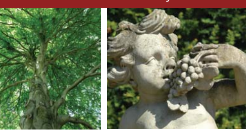
The botanical garden in Caen