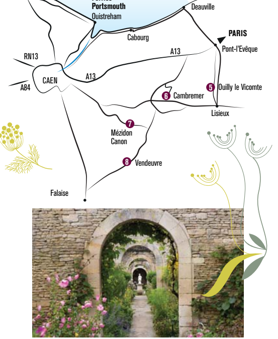
The 'chartreuses' of the gardens of the Château de Canon