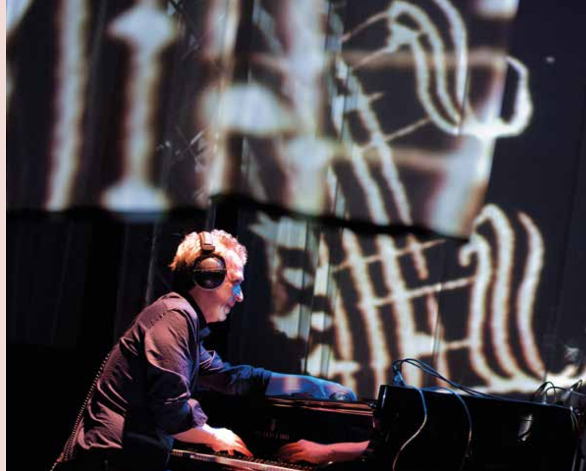
Concert at the Books & Music Festival of Deauville

Since the end of the 19th century, inDeauville has been an inspirational and creative land that fascinates painters, photographers, film directors... Their stories inspire a permanent cultural program that supports creation, innovation, and discoveries by inviting artists during festivals or creation residences, and by organizing meetings in which they can share their works. Sharing art with young people is common in most events.