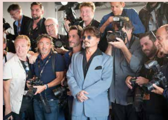
Johnny Depp taking a break with the photographers of the American Film Festival (2019).