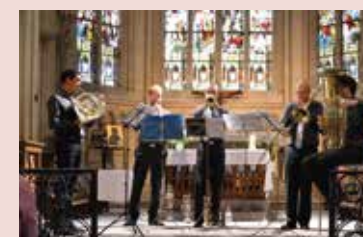
The Festival of New Talents and Guests in Villers-sur-Mer.