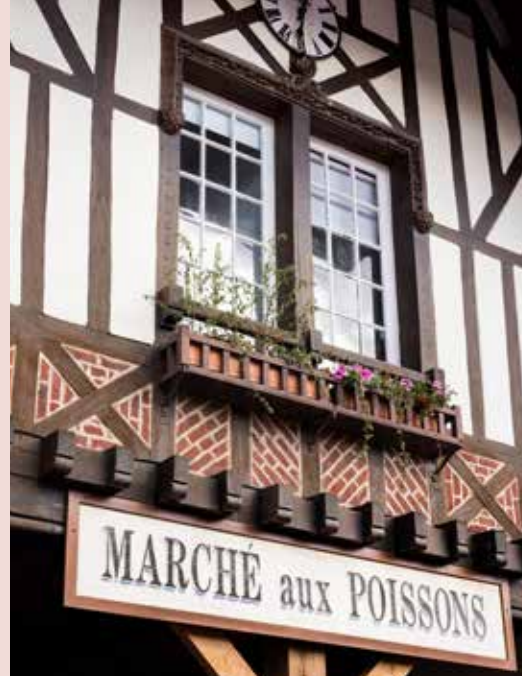
The fish market, Deauville.