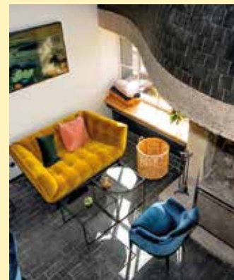
Inside "Les Jardins de Coppélia".

ANCIENNE POSTE DE TROUVILLE , 16 rue Amiral de Maigret, 14360 TROUVILLE-SUR-MER, Phone: +33 (0) 2 31 65 65 18