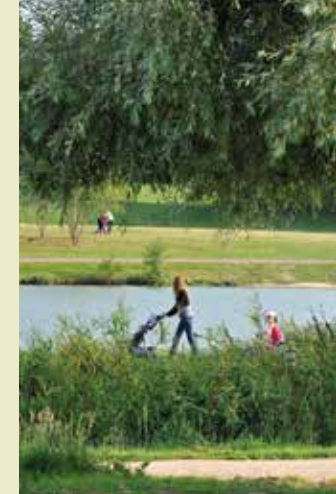
The marshes of Blonville-Villers.