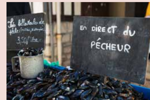
Fish stall at the scallop festival, Villers-sur-Mer.