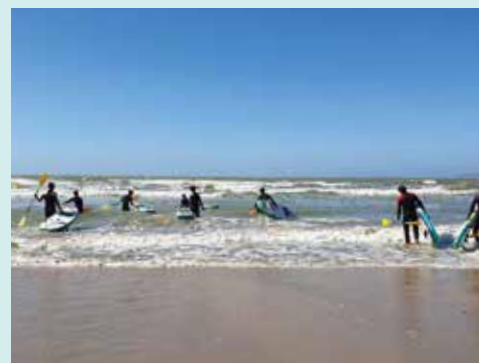
Paddle session.