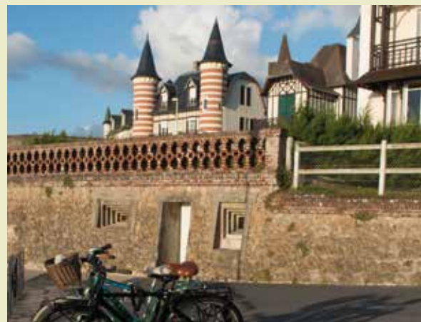
The historical artistic style on the seafront of Blonville-sur-Mer.