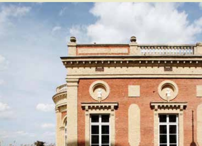
Bricks and low-relief ornaments on Villa Le Cercle.