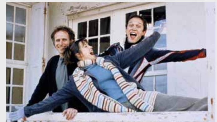
On the beach of Blonville-sur-Mer, the actors of the film “Je reste”, directed by Diane Kurys: Sophie Marceau, Charles Berling and Vincent Perez