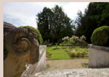
Calouste Gulbenkian Park.

♥ To do: discover the home in which Claude Monet lived for forty years and the artist's identically reconstituted studio.