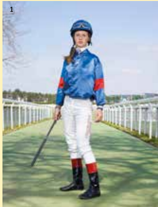
1 - Portrait of a jockey by Charles Freger for the Planches Contact festival (2010).

ENJOY WIN AND PLACE, FORECAST OR TRIO BETS