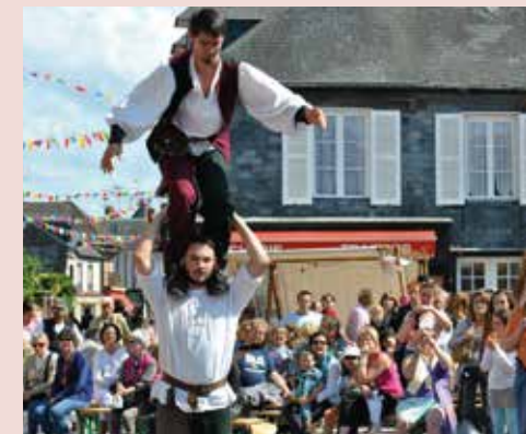
The Medieval of Touques.