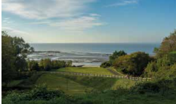
Graves Park of Villerville.