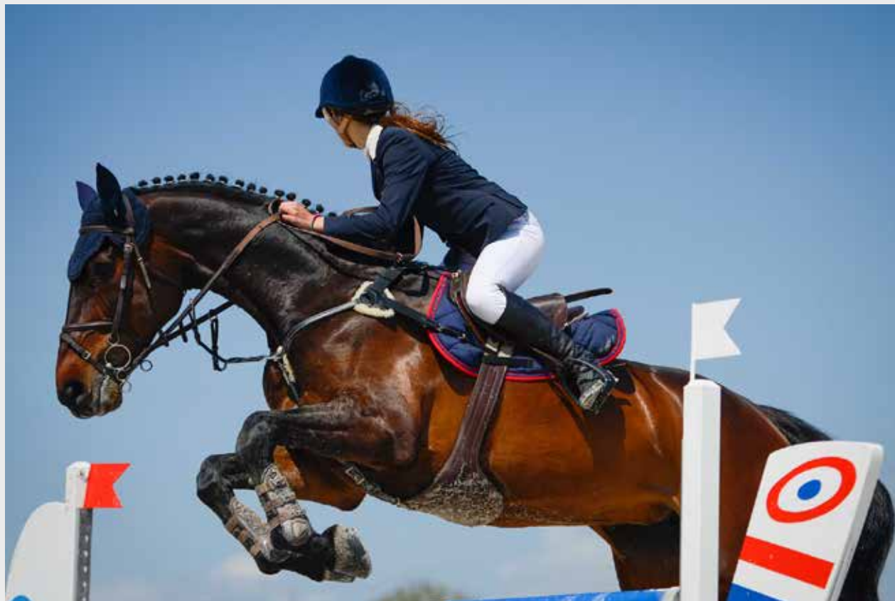
Jumping at the Longines - Deauville International Equestrian Complex.