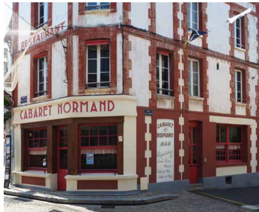
Le Cabaret Normand, famous bar where Jean-Paul Belmondo ordered a Picon-bière, when he arrived at Tigreville, in the "A Monkey in Winter" film.

IN VILLERVILLE, follow the hiking circuit inspired by the "A Monkey in Winter" film. This film, directed by Henri Verneuil, has been so much appreciated that it has become a national icon. You'll discover the main shooting sites including the Cabaret Normand, the Hôtel Stella and the police station, where Jean-Paul Belmondo and Jean Gabin shot the scenes that have forever marked the village. Map on sale in the inDeauville tourist information offices.