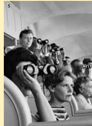
5 - Women attending horse races.

HAVE A PICNIC ON THE GRASS OF THE RACECOURSE