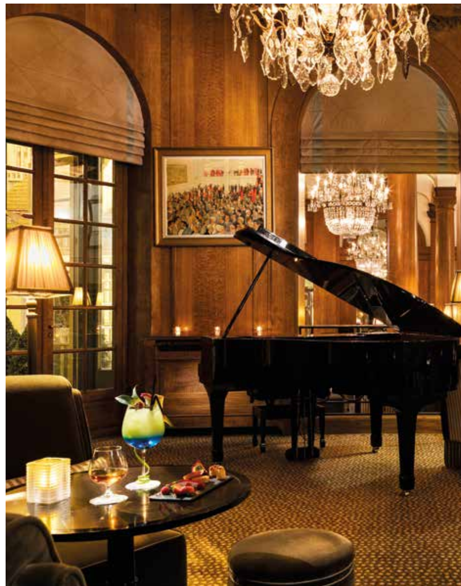
The bar of the 5-star Hôtel Barrière Le Normandy – Photo by Fabrice Rambert.

*Alcohol abuse is dangerous for health, consume with moderation.