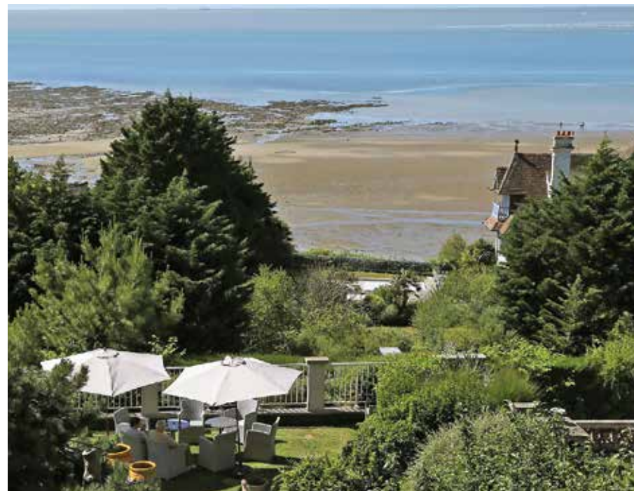
Hôtel Le Bellevue*** in Villerville: view on the garden and the sea.

Picturesque, Neoclassic, “augeronne” (from the Pays d’Auge), Gothic, exotic... the vocabulary of the seaside architecture is as rich as the styles are varied. Most architects wanted to build a unique house, different from all others, drawn from their imagination. Hotel owners who chose these precious gems to welcome passing-by tourists have preserved their spirit and fantasy. From fireplaces, floor parquets or tiles, beams or chiselled balconies, to views on the sea or on the countryside, patios or large parks... every villa is unique.