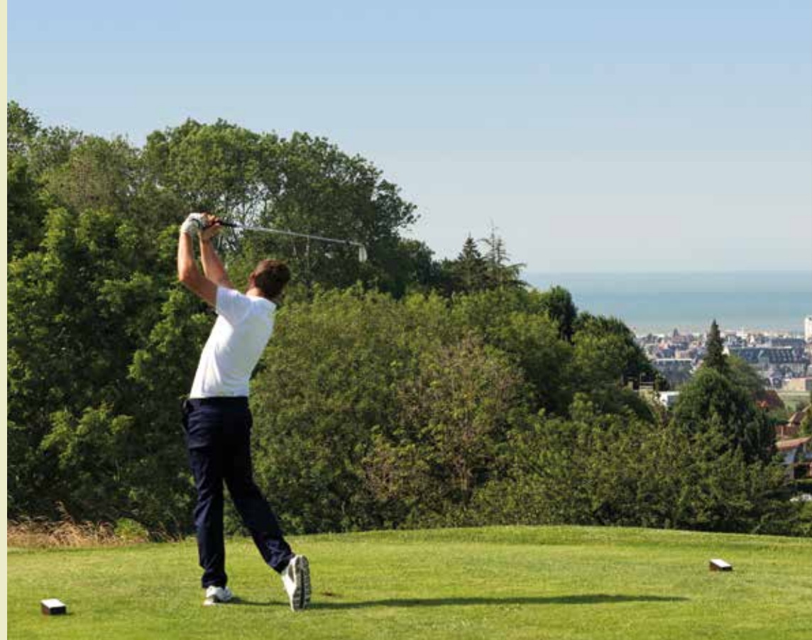
Facing the sea at the Deauville golf field