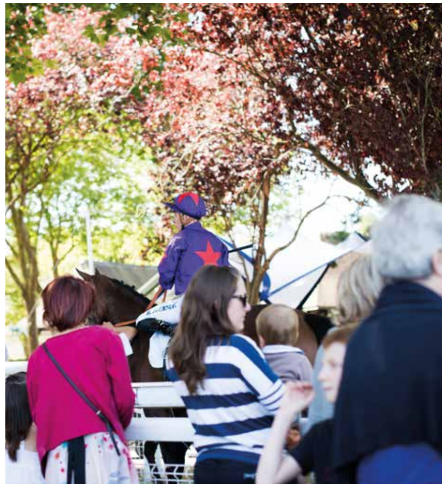
Presentation of horses at the presentation ring of the Deauville-La Touques racecourse.

From mid-June to the end of October, during the Clairefontaine Meeting, the Deauville-Clairefontaine racecourse vibrates with the encouragement clapping of the public. Why is it unique? Because it is the only racecourses on the Norman coast that hosts all three horse-racing disciplines: flat, trotting, jumping (hedges and steeple-chase). About twenty horse racing contests are held here every year, including three key events: the "Grand steeple-chase de la Ville de Deauville", the "Grande course de Haies-Guillaume d'Ornano" and the "Grand Prix de Clairefontaine", closing the season every year.