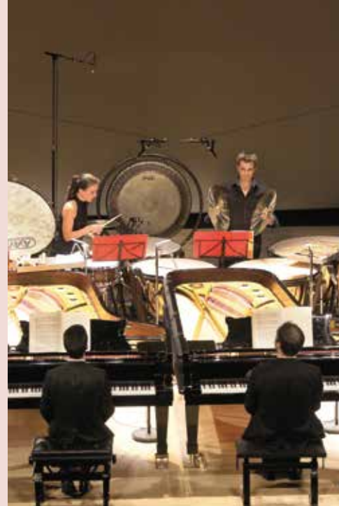
The Musical August and the Easter Festival brings together the most promising musicians of their generation every year in Deauville.

Planches Contact, a festival of photographic creation, presents the works of photographers invited in residence in Deauville to match their photographic universe with the city. The Festival is organized around five sections: the guest photographers, the young talent springboard, the "carte blanche", the monumental exhibition on the beach, and the OFF that offers passionate views on the city.