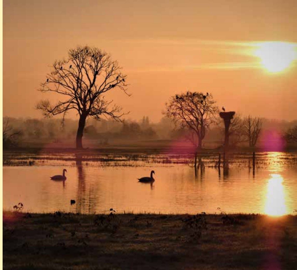
Sunrise on the marshes of Blonville-Villers.

Situated on the heights of Deauville, in Bénerville-sur-Mer, the 110 m-high Mont-Canisy offers a breath-taking view on the Côte Fleurie. Indeed, the strategic position of the Mont-Canisy, situated on the valley facing the Seine Bay, led it to be transformed into a coast artillery position. The Conservatoire du littoral currently ensures the preservation of the flora and fauna of this natural site, which hosts over 200 species of plants, many of which are protected. It's an oasis of orchids, with the fullest blooms of 13 species occurring from April to July. The park hosts three species of regionally protected birds (nightingale, grasshopper warbler and melodious warbler), several families of butterflies and a nationally protected snake: the Queen snake. Military facilities and natural caves favour the presence of bats.