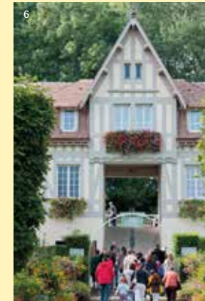
6 - The Deauville-Clairefontaine racecourse. Photo by Sandrine Boyer Engel. 7 - Pony tour at the Deauville- Clairefontaine racecourse. Photo by Sandrine Boyer Engel.