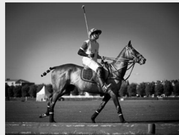
Playing polo in Deauville.