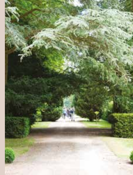
Calouste Gulbenkian Park.