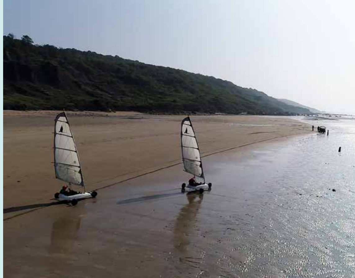
Sand yachting - Photo by Ville de Deauville.

The large stretches of sand of inDeauville beaches are perfect to practice all kinds of water sports. Directly from the sea or on the wet sand, you'll have the choice among fresh and invigorating, soft and stimulating feelings. At our clubs, you can try out the latest activities: wingfoiling and waveskiing may be an alternative to paddling, sand yachting and kayaking. Here, you can discover new landscapes and play sports at the same time. InDeauville, you can hike on the water on a kayak, travel along the Jurassic cliffs, carried by the wind coming from the English Channel, or surf the waves.