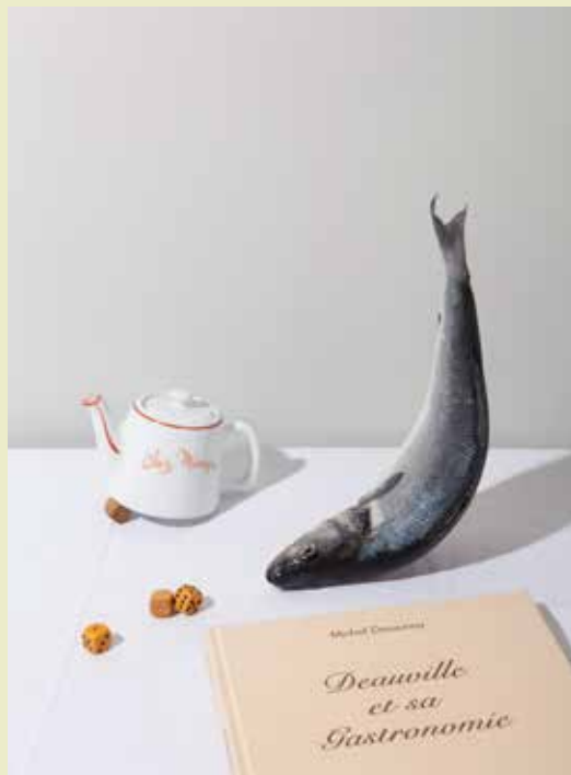
«Gastronomie» series by Audrey Corregan for the Planches Contact festival (2013).

*Alcohol abuse is dangerous for health, consume with moderation.