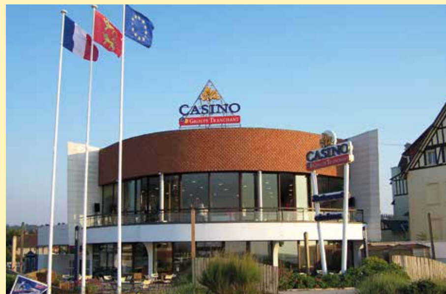
The Casino of Villers-sur-Mer was built in front of the sea in 1988. Photo by Ville de Villers-sur-Mer.