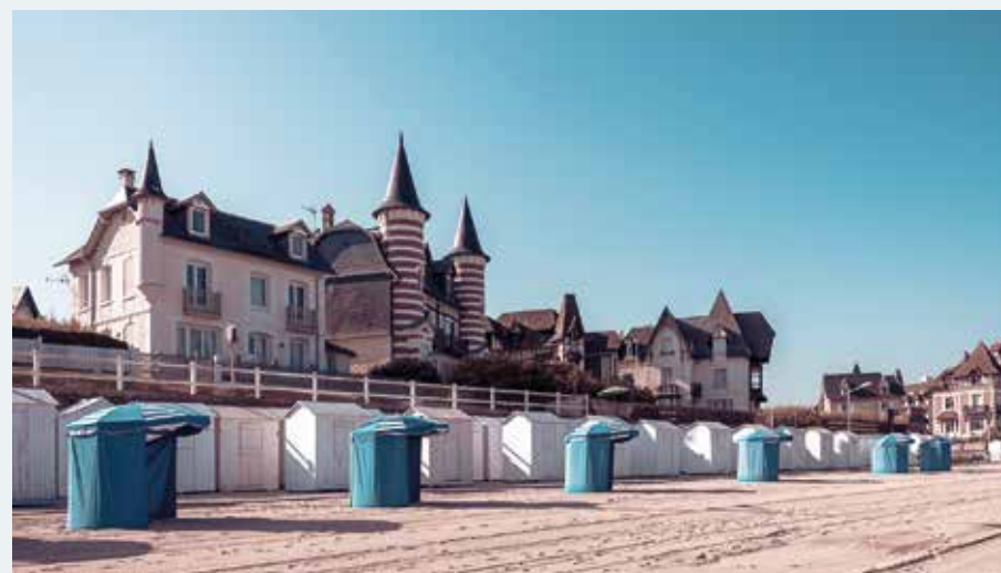
The Blonville-sur-Mer beach, bordered by seaside villas.