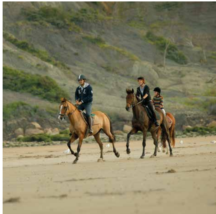
Horse-riding on the beach of Villers-sur-Mer.

The Pays d'Auge countryside has shadowed paths stretching along green meadows bordered by the wooden palisades of stud farms and half-timbered houses. Horse-riding instructors organize tours through different landscapes, ranging from the Pays d'Auge countryside to Saint-Pierre-Azif, where riders can discover hilly paths and large apple tree orchards. They can also ride through the sometimes-steep coast, on the heights of Mont-Canisy, right over Bénerville-sur-Mer. Or discover the Marais de Blonville-Villers, and ride between the canals and ditches which are home to protected flora and fauna.