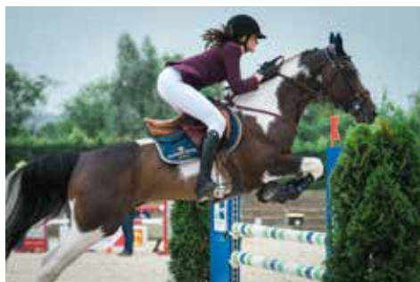
Jump'in Deauville at the Longines - Deauville International Equestrian Complex.