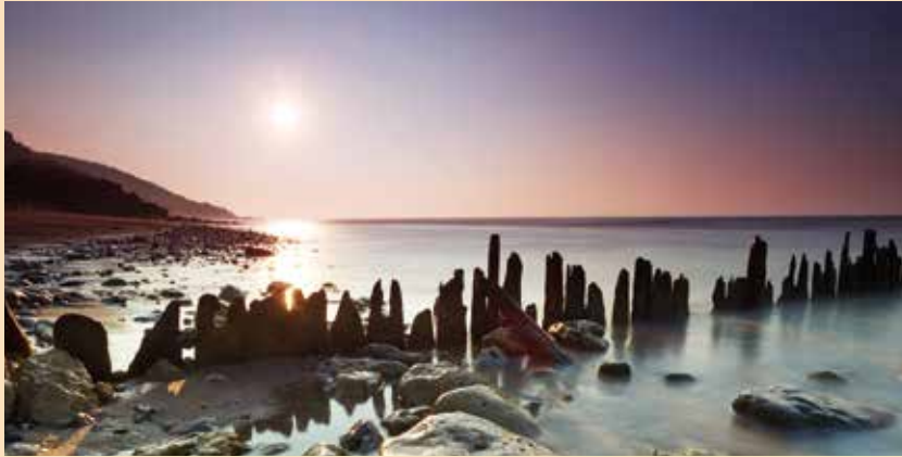
View of the old barriers - Photo by Julien Boisard.