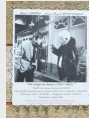
Photo from the “A Monkey in winter” film, posted on a wall of rue Butin in Villerville.

Deauville Barriere Casino 2 rue Edmond Blanc - Deauville Le Hangar à énigmes 55 rue du Général Leclerc - Deauville 67 bis rue du Général de Gaulle - Trouville-sur-mer