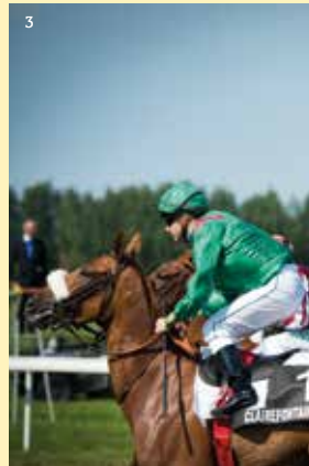
3 - Photo by Sandrine Boyer Engel. 4 - Photo by Delphine Barré.