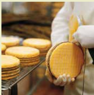
Livarot and its five thin strips of dry reeds. Fromagerie de Livarot.