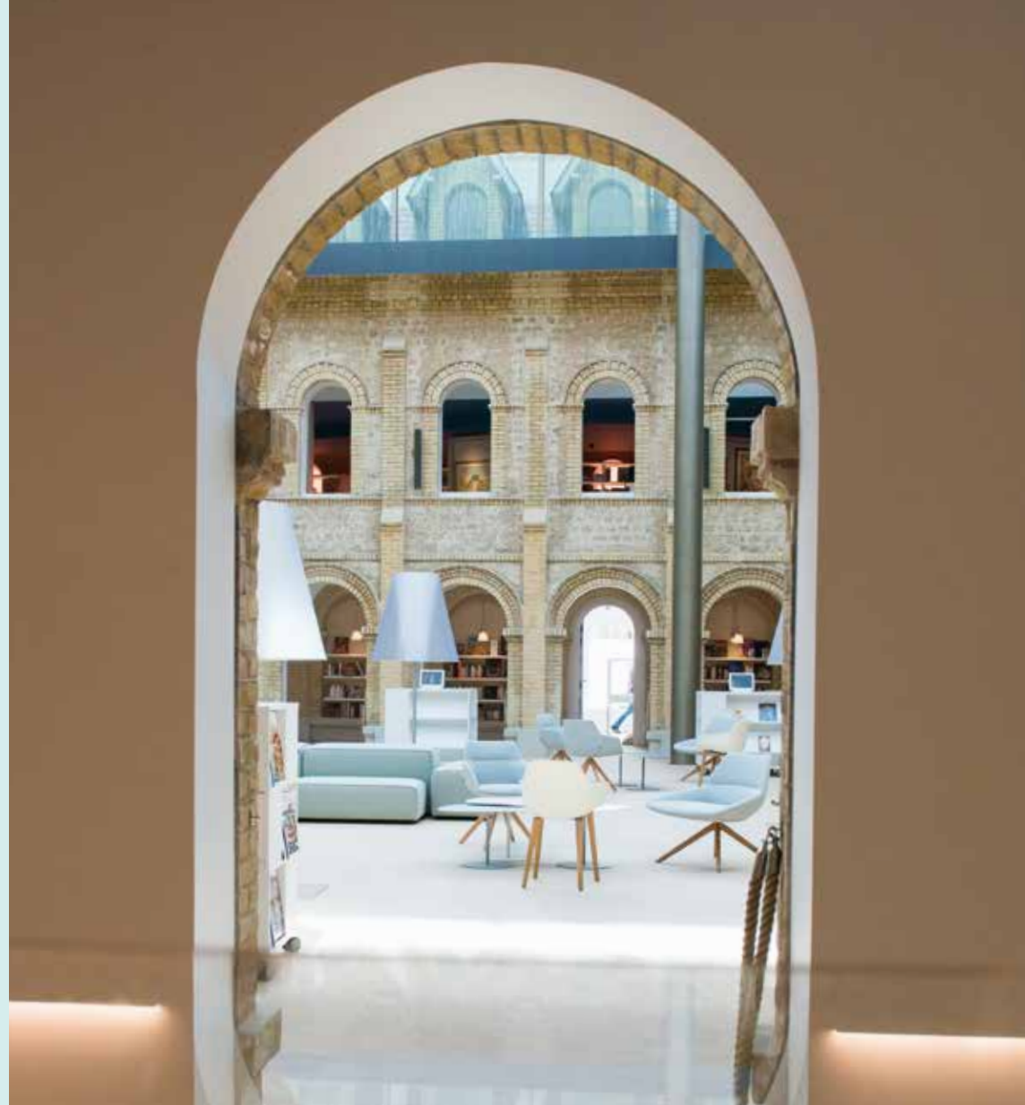
The Franciscaines cloister: a reading and meeting place.

At the heart of the building, a museum is dedicated to figurative painter André Hambourg (1909-1999). Due to a very dynamic acquisition program, works by Eugène Boudin, Paul Signac, André Lhote, Moïse Kisling, Raoul Dufy joined the museum collection. These works, those lent by major national and international museums, and the impressionist canvas of the "Painting in Normandy" collections are revealed to the public by Les Franciscaines through temporary exhibitions.