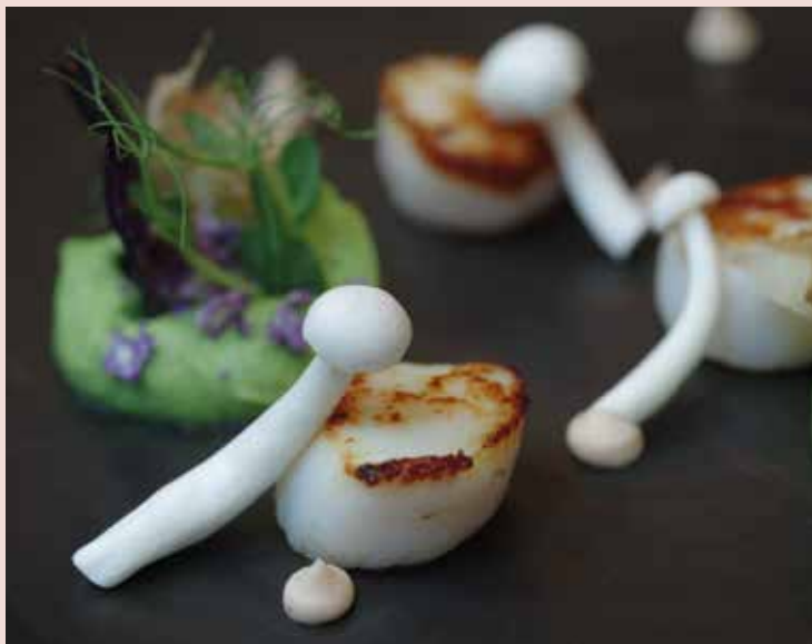
Gourmet scallops at L'Essentiel restaurant.