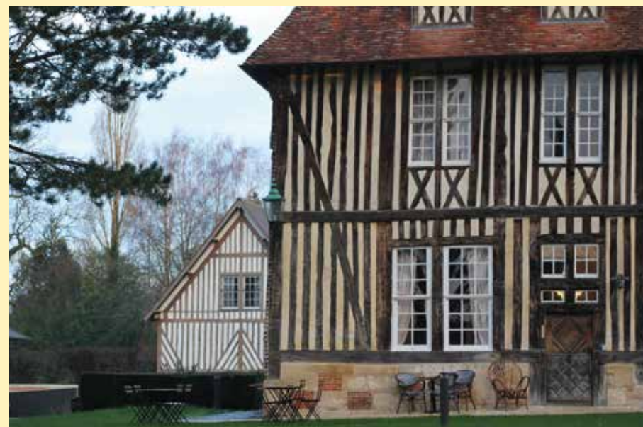
Les Manoirs des portes de Deauville*****.