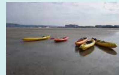
Kayaks on the beach.