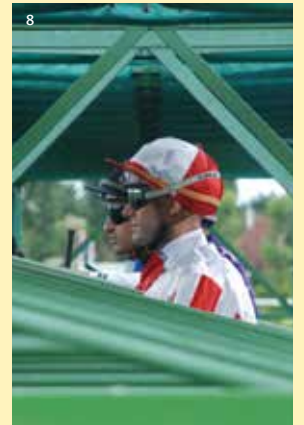
8 - Deauville- Clairefontaine racecourse.

OUR FAVOURITE ♥: ATTEND A HORSE RACE BY NIGHT, THEN RELAX IN A FRIENDLY ATMOSPHERE.