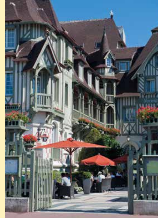
Hôtel Barrière Le Normandy *****