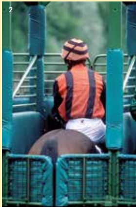
2 - Photo by Sandrine Boyer Engel.