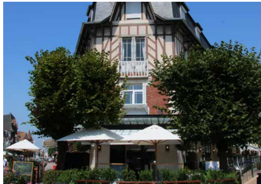
At Marion's restaurant.

With 600 km of coasts, Normandy draws part of its gastronomic identity from the sea. In summer, fishermen stock up on mussels, sole, lobsters and mackerel before harvesting the traditional scallops in winter. Directly available in the local markets, they are even better cooked by our chefs. Saint-Vaast oysters, lobsters, prawns and whelks are all prepared with love to make up flavoursome dishes or platters. From Villers-sur-Mer to Deauville and Trouville-sur-Mer, you can enjoy fish and seafood on a terrace, feet in the sand or in front of the fishing port.