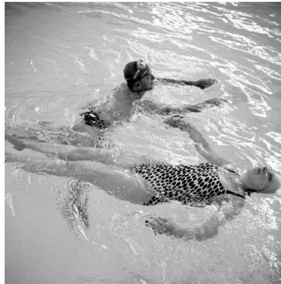
"Les frontières de Deauville" (Deauville borders) series by Lore Stessel – 2013 Planches Contact Festival.

DEAUVILLE SWIMMING POOL Boulevard de la Mer, 14800 DEAUVILLE, Phone: +33 (0) 2 31 14 02 17 Aquagym courses and individual swimming lessons