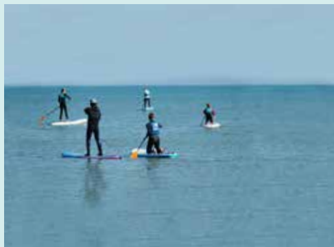
Paddle session.