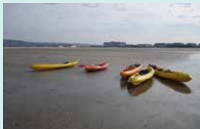
Kayaks on the beach.