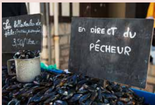
Fish stall at the scallop festival, Villers-sur-Mer.