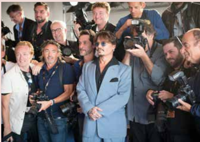
Johnny Depp taking a break with the photographers of the American Film Festival (2019).