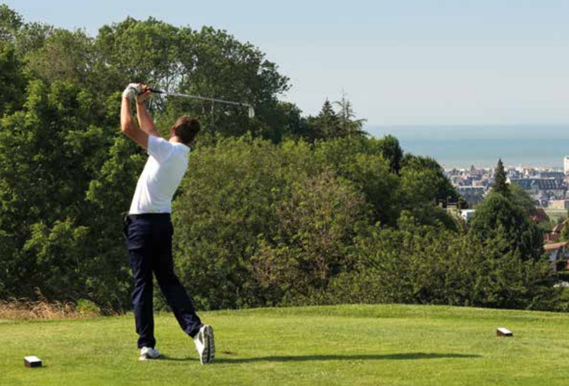
Facing the sea at the Deauville golf field – Photo by Fabrice Rambert.

At the very heart of the Pays d'Auge, the Golf Barrière Saint-Julien is situated on an extraordinarily landscaped and maintained 90-ha domain with flowered apple trees. Architects Alain Pratt and Bill Baker came up with two courses, both designed in a very British style: “Le Vallon” (18 holes – 6,035 m), championship field, where several canals cunningly stretch along fairways and greens, and “Le Bocage” (9 holes – 2,258 m), properly named for its nice landscapes, more suitable to less experienced golf players. Here, you can try to outdo yourself with perfect swings. To improve your game, individual, couple or group lessons as well as internships are taught by Stéphanie Dallongeville, a professional player for 25 years on the European circuit where she won numerous trophies.