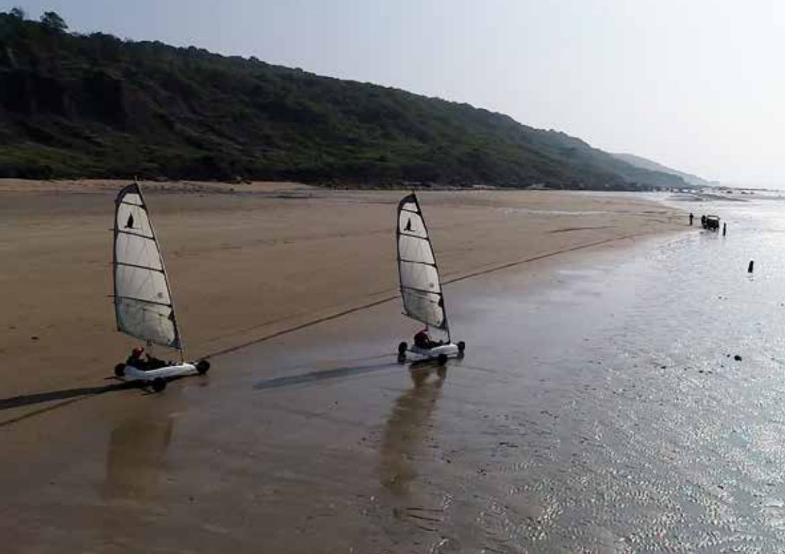
Sand yachting