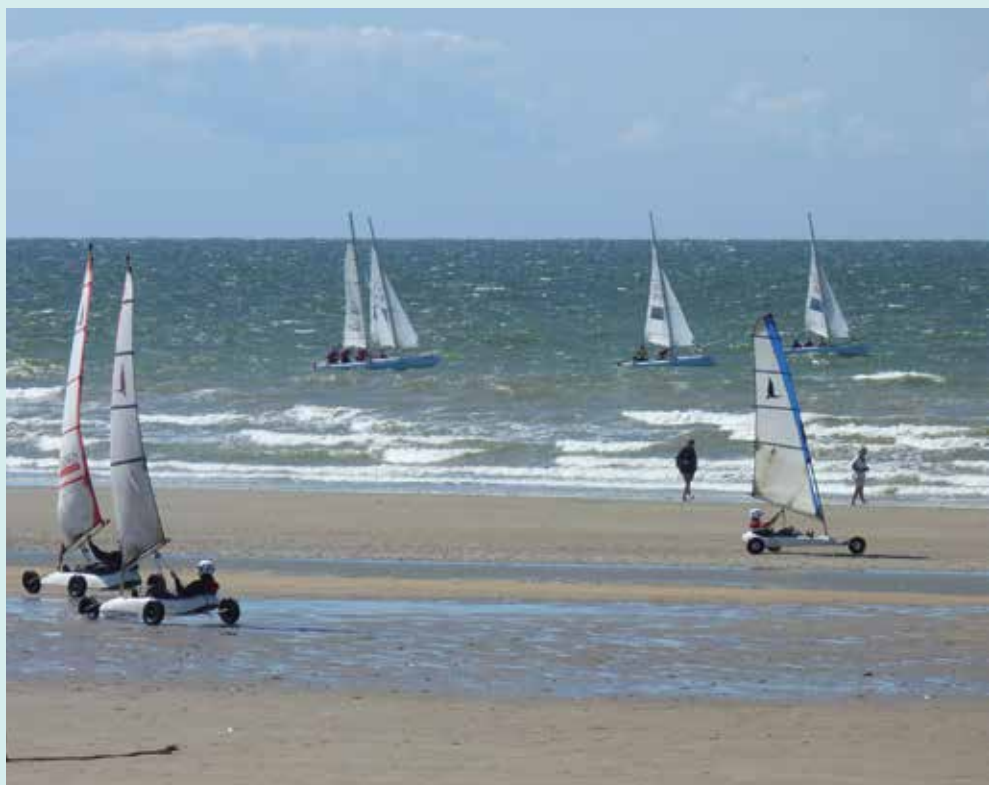
Sand yachting session on the beach of Villers-sur-Mer.