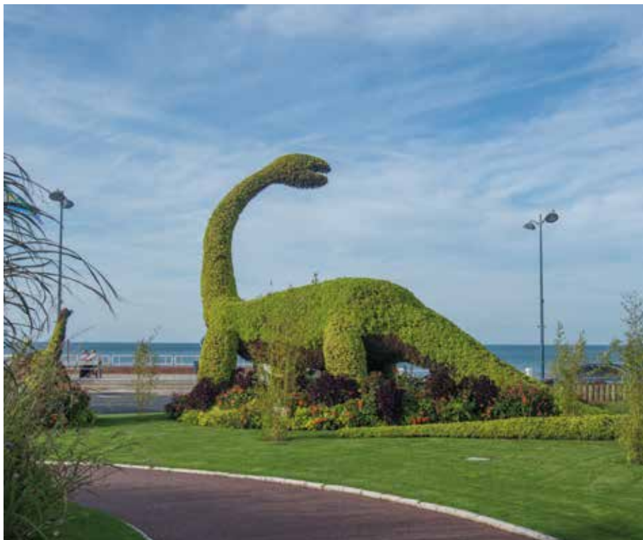
Plant dinosaur in front of the sea, Jean Mermoz square – Photo by Ville de Villers-sur-Mer.