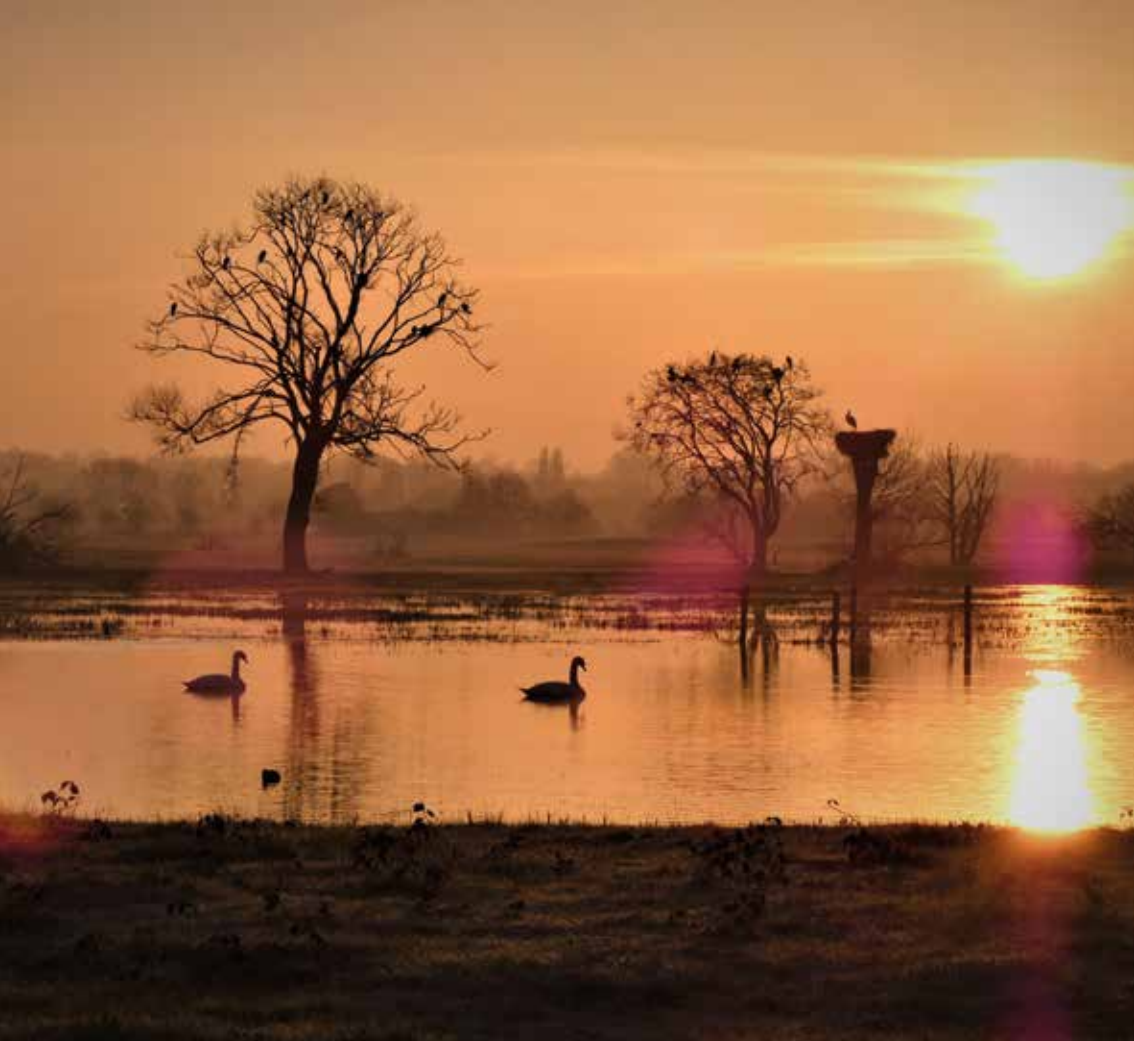
Sunrise on the marshes of Blonville-Villers.

With a surface of 3,500 hectares and a perimeter of 28 km, the Saint-Gatien-des-Bois forest is the largest of the Calvados region. It had many owners throughout the centuries, sometimes belonging to nobles, sometimes broken up and sold to several buyers. Ulrich Güttinger, Swiss writer, found the oasis he was longing for here. He often welcomed the greatest literary figures of his time in his private wooden chalet: Victor and Adèle Hugo, Alfred de Musset, Charles-Augustin Sainte-Beuve, Alexandre Dumas, Gustave Flaubert, Charles Baudelaire... Today, this forest has several private owners, who exploit it for wood production or use it as a hunting domain.