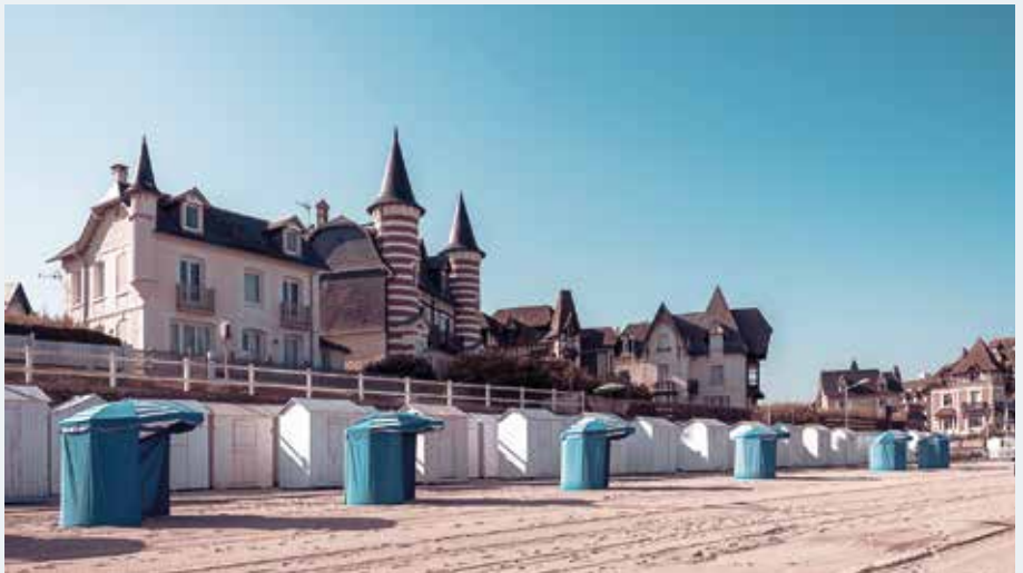
The Blonville-sur-Mer beach, bordered by seaside villas.