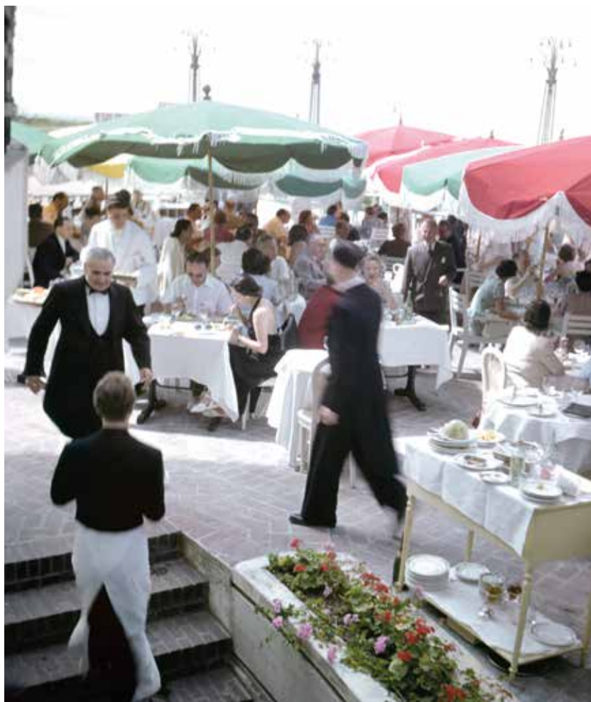
Effervescence on the terrace of the Deauville Barrière casino – Photo by Willy Rizzo.