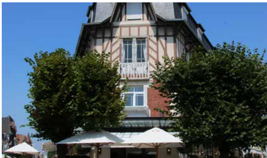
At Marion's restaurant.