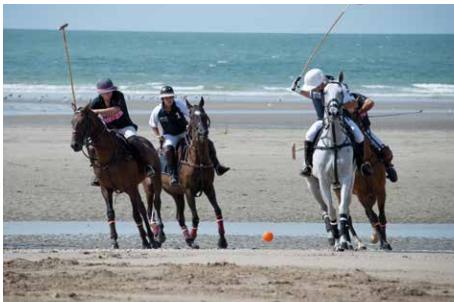
Beach polo