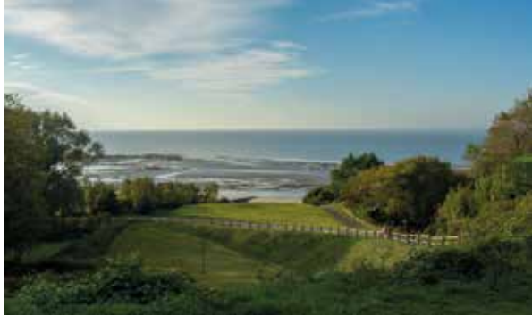
Graves Park of Villerville.