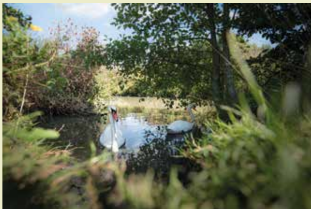
The marshes of Blonville-Villers.