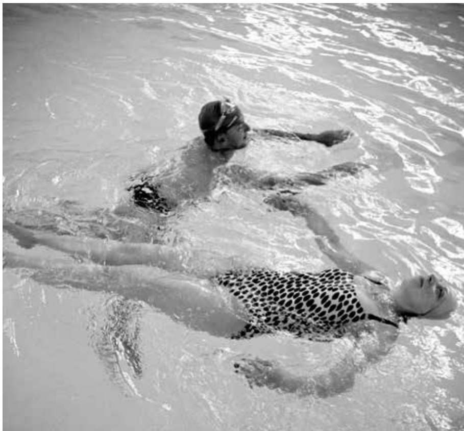
"Les frontières de Deauville" (Deauville borders) series by Lore Stessel – 2013 Planches Contact Festival.

Boulevard de la Mer, 14800 DEAUVILLE, Phone: +33 (0) 2 31 14 02 17 Aquagym courses and individual swimming lessons