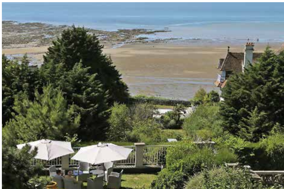
Hôtel Le Bellevue*** in Villerville: view on the garden and the sea.