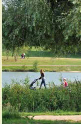
The marshes of Blonville-Villers.