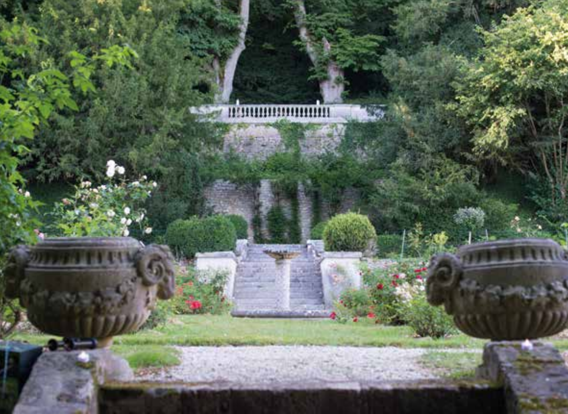
Calouste Gulbenkian Park

The upper part: the upper plateau, made of softwood trees and a large meadow, overlooks the park.