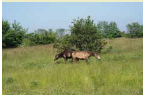
The marshes of Blonville-Villers.

♥ To do: take the 9.5-km hiking trail, starting from the Town Hall and accessible outside the hunting season, to discover part of the forest. Ask for the map on sale at the inDeauville tourist information offices or check the itinerary at en.indeauville.fr .