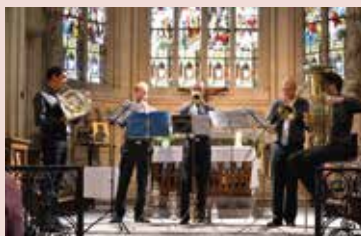
The Festival of New Talents and Guests in Villers-sur-Mer.