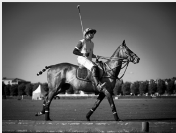
Playing polo in Deauville.