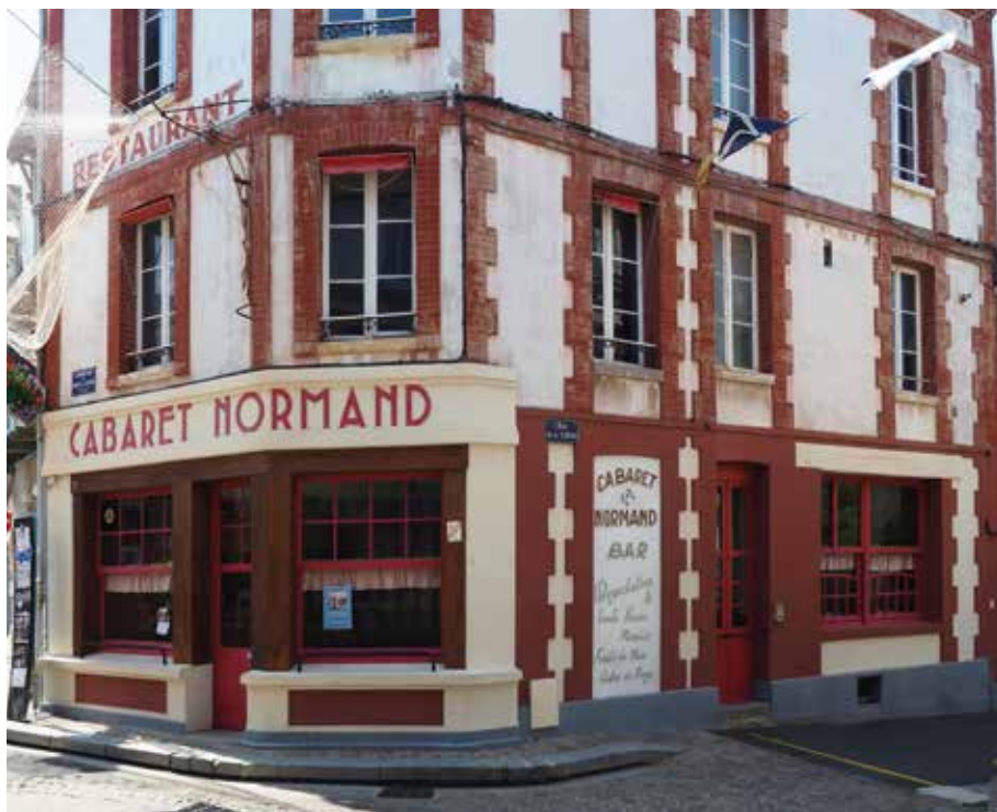
Le Cabaret Normand, famous bar where Jean-Paul Belmondo ordered a Picon-bière, when he arrived at Tigreville, in the "A Monkey in Winter" film.

IN VILLERVILLE, follow the hiking circuit inspired by the "A Monkey in Winter" film. This film, directed by Henri Verneuil, has been so much appreciated that it has become a national icon. You'll discover the main shooting sites including the Cabaret Normand, the Hôtel Stella and the police station, where Jean-Paul Belmondo and Jean Gabin shot the scenes that have forever marked the village. Map on sale in the inDeauville tourist information offices.