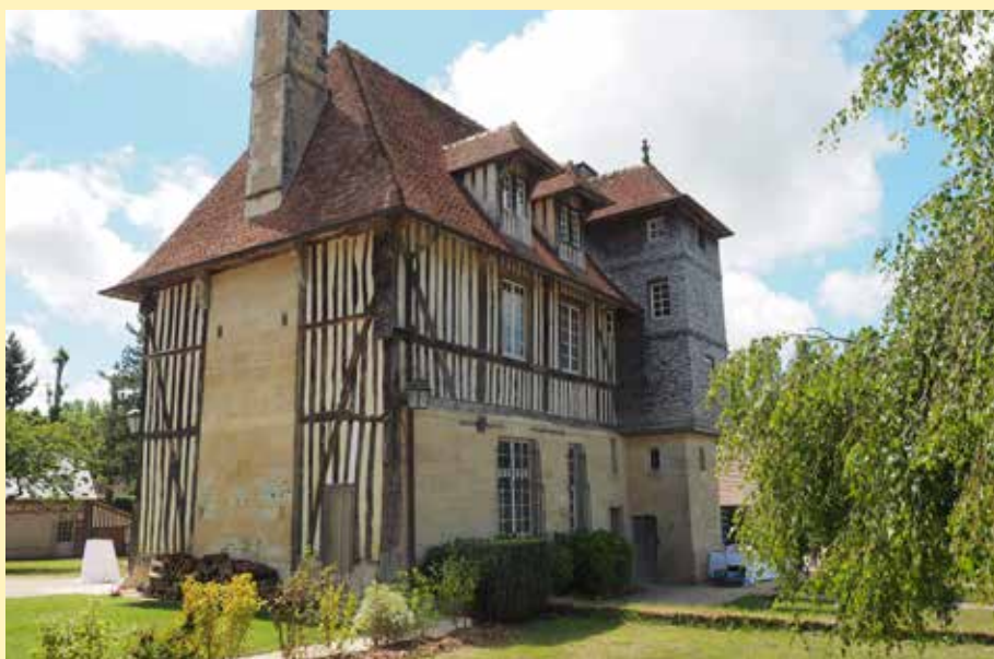
Les Manoirs des portes de Deauville****.