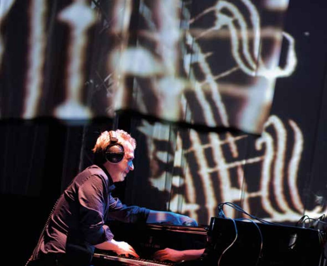
Concert at the Books & Music Festival of Deauville