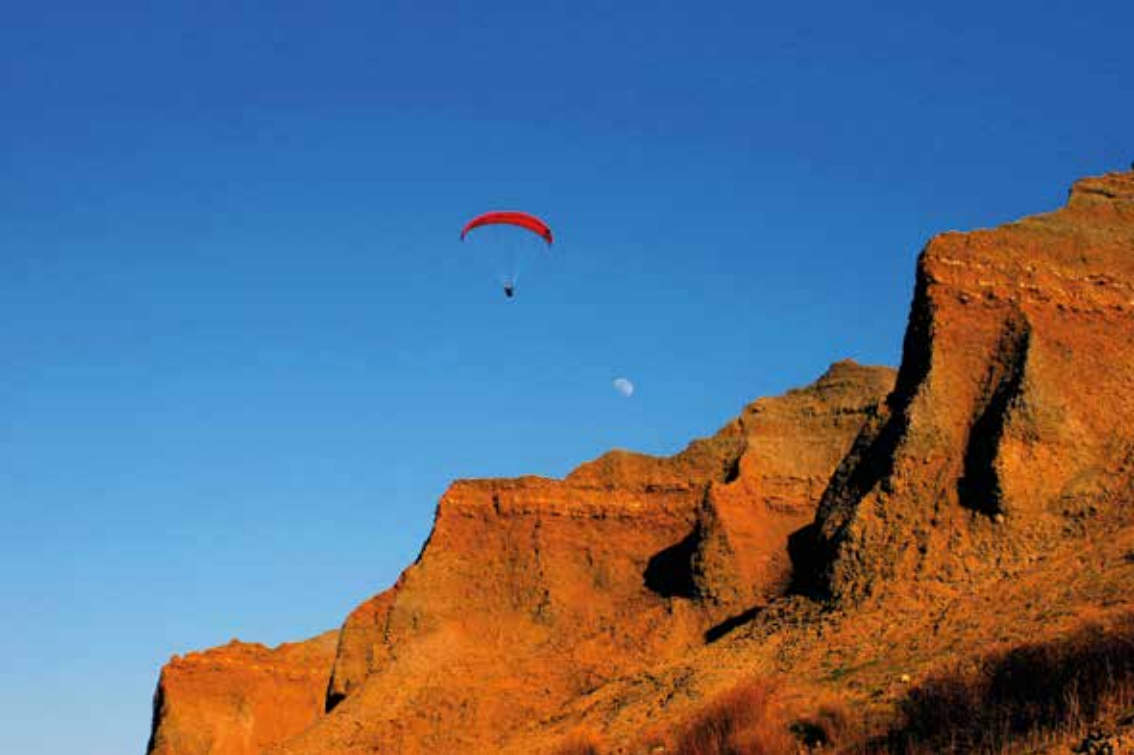
Vaches Noires cliffs

It also hosts a 300-m 2 permanent exhibition area focused on three archaeological sites of Villers-sur-Mer: the Vaches Noires cliffs , the marshes of Blonville-Villers and the Greenwich Meridian area. Spectacular, interactive and sensory reconstitutions make it a cultural, scientific, and a fun place. The 360° planetarium it hosts regularly schedules screening sessions to discover the universe.