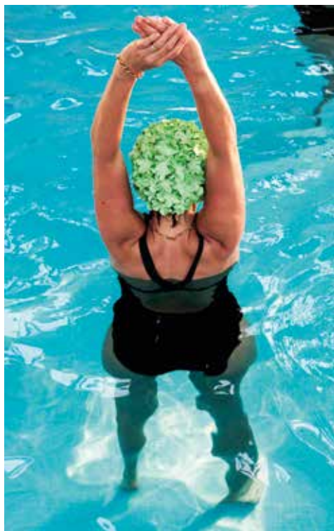
Aquagym lesson at the Deauville swimming pool – Photo by Ville de Deauville.