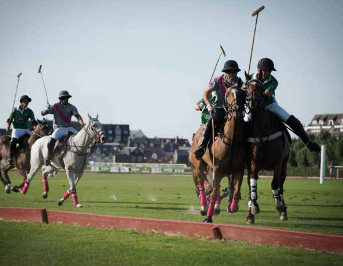
A polo match on the Deauville-La Touques racecourse – Photo by Nâïade Plante.

In August, the Barrière Deauville Polo Cup invades the polo fields of the Deauville-La Touques racecourse for three weeks.