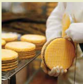
Livarot and its five thin strips of dry reeds. Fromagerie de Livarot.