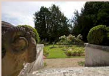
Calouste Gulbenkian Park.