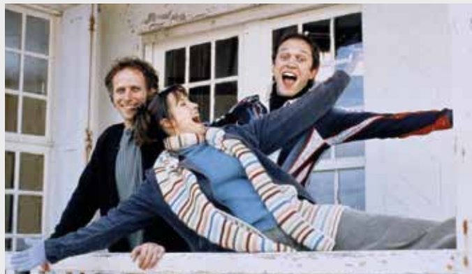
On the beach of Blonville-sur-Mer, the actors of the film "Je reste", directed by Diane Kurys: Sophie Marceau, Charles Berling and Vincent Perez