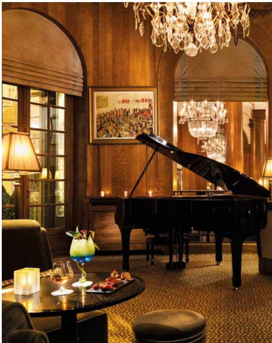
The bar of the 5-star Hôtel Barrière Le Normandy Deauville

HÔTEL BARRIÈRE LE NORMANDY DEAUVILLE***** 38 rue Jean Mermoz, 14800 DEAUVILLE, Phone: +33 (0) 9 70 82 13 14