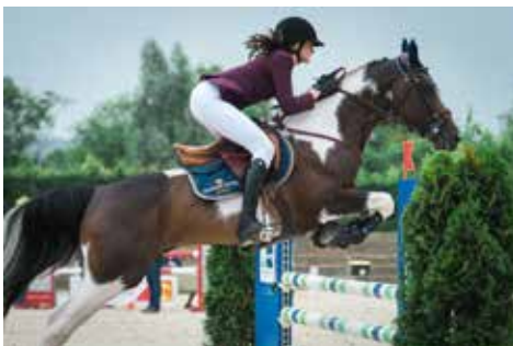
Jump'in Deauville at the Longines - Deauville International Equestrian Complex.