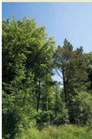
Saint-Gatien-des-Bois forest.