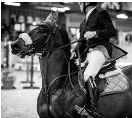
International Jumping Contest at the Longines - Deauville International Equestrian Complex.