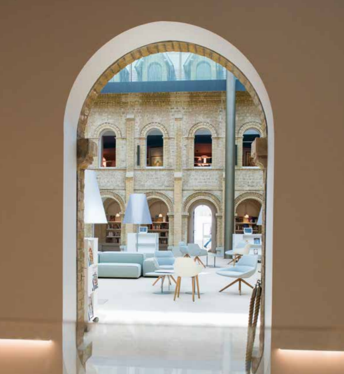
The Franciscaines cloister: a reading and meeting place.