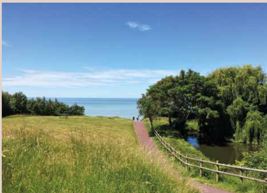
Graves Park.