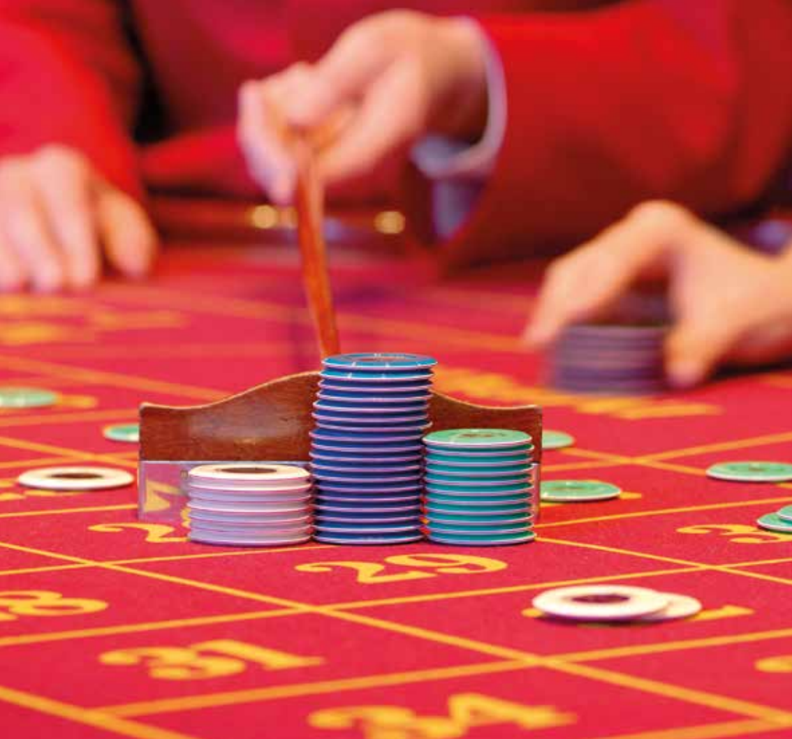
Board game – Photo by Guy Isaac.

In Villers-sur-Mer, nine casinos have been built since 1856 to adjust to a fashionable seaside resort; the current Casino Tranchant dates to 1988. For gambling and gaming, the casino has 75 slot machines, a Blackjack table and another for English roulette, and 5 stations for the electronic roulette. Between two bets, you can have a cocktail at the bar or have dinner on the terrace of the casino's restaurant facing the large beach and the sea. And if you are fond of movies, the casino also has a cinema.