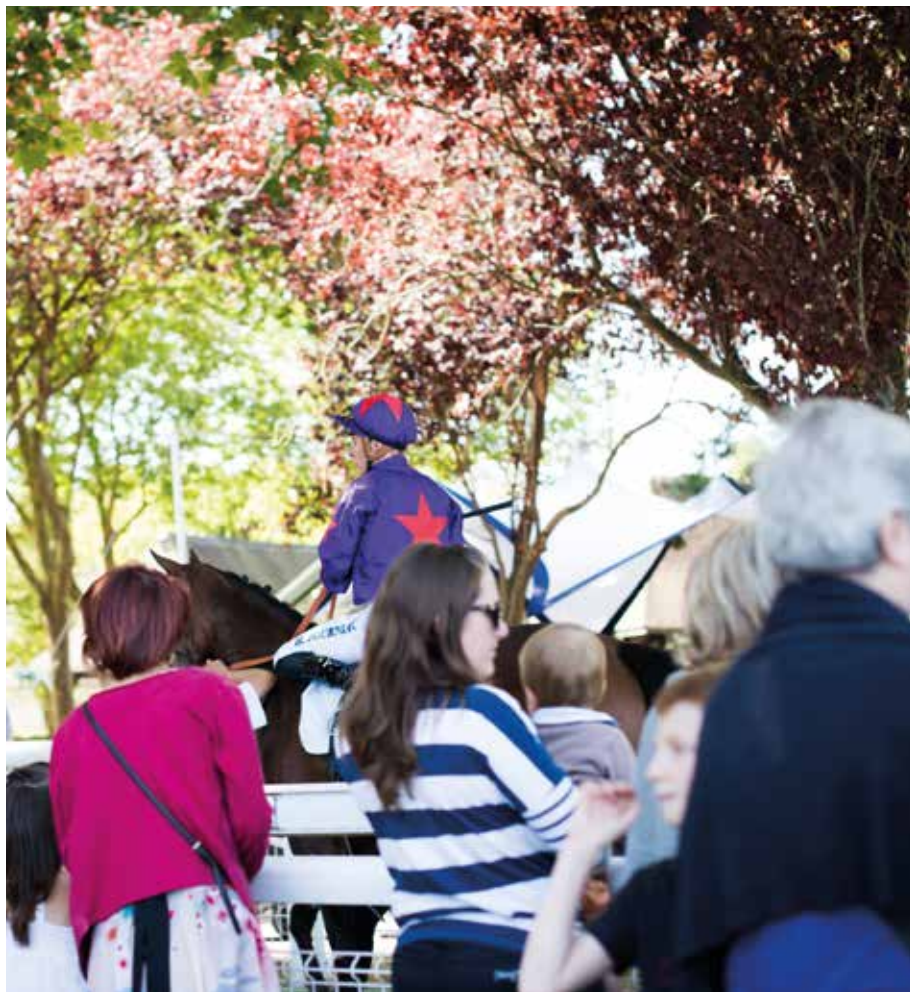
Presentation of horses at the presentation ring of the Deauville-La Touques racecourse.