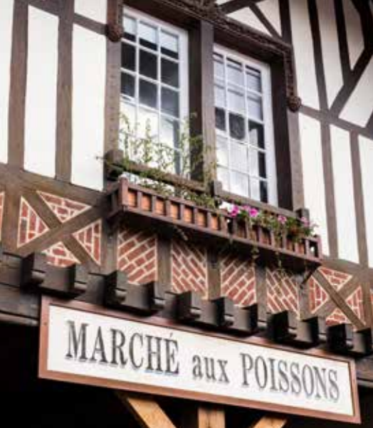
The fish market, Deauville.