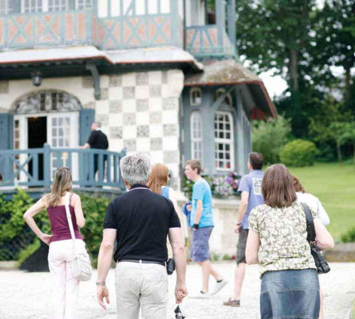
Visit at the Strassburger Villa, the most emblematic Norman-style villa.