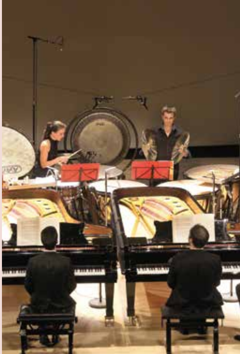
The Musical August and the Easter Festival bring together the most promising musicians of their generation every year in Deauville.