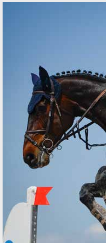
Jumping at the Longines - Deauville International Equestrian Complex.