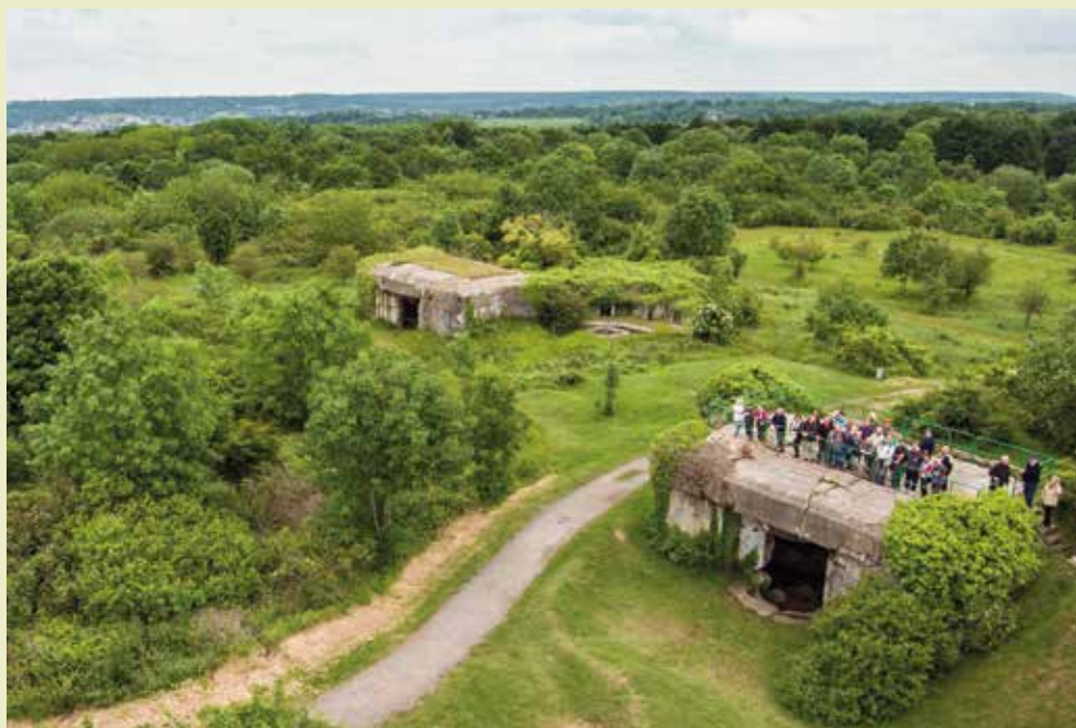
The batteries of the Mont-Canisy.