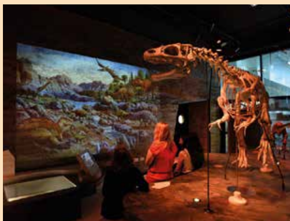
Understanding the jurassic period at the Paléospace of Villers-sur-Mer