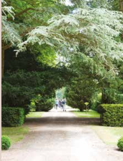
Calouste Gulbenkian Park.