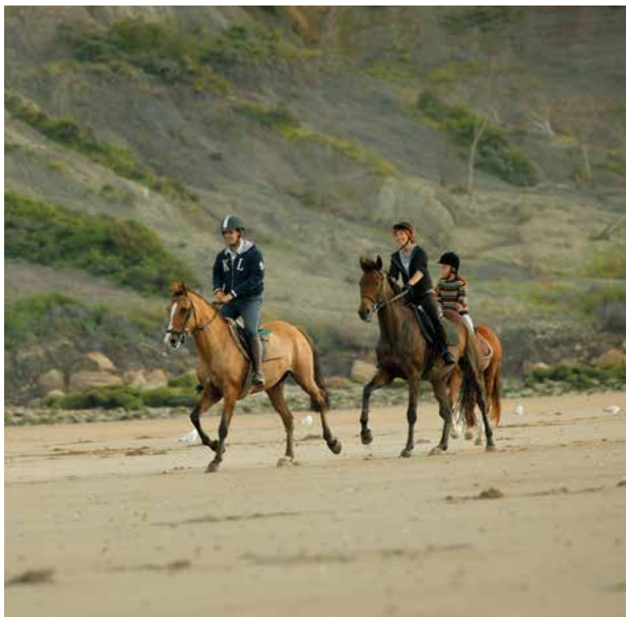
Horse-riding on the beach of Villers-sur-Mer.

THE LONGINES DEAUVILLE INTERNATIONAL EQUESTRIAN COMPLEX, 14 avenue Ox and Bucks, 14800 SAINT-ARNOULT, Phone: +33 (0) 2 31 14 04 04. Indoor arenas, outdoor arenas, gallop tracks, grass paddocks, stables, club- house and restaurant. Horseback tours on Deauville beach (level 3 gallop).