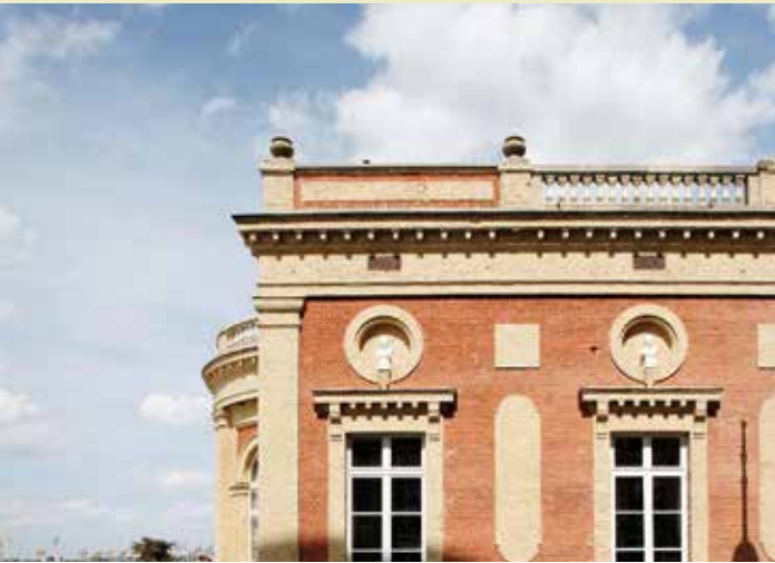
Bricks and low-relief ornaments on Villa Le Cercle.