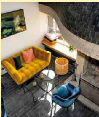
Inside "Les Jardins de Coppélia".