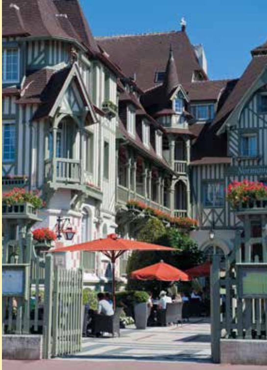
Hôtel Barrière Le Normandy *****