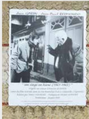
Photo from the "A Monkey in winter" film, posted on a wall of rue Butin in Villerville.

The Promenade des Planches where baileys are marked with the name of film directors and actors participating every year in the American Film Festival! Tribute to Robert Pattinson with Philippe Augier (2017).