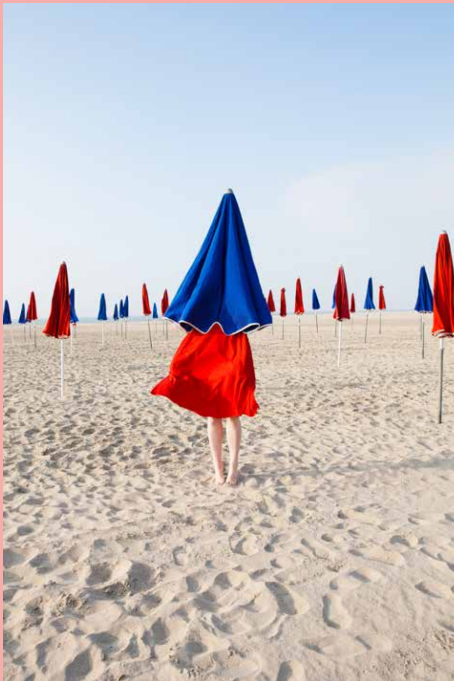
The Deauville beach umbrellas by Maia Flore for the Planches Contact photographic festival (2016).