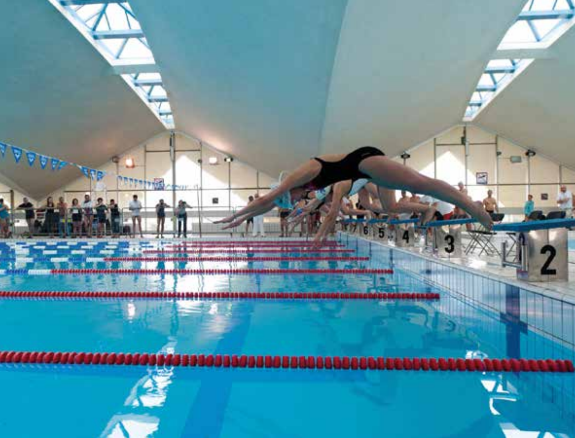
Seawater Olympic swimming pool

Today, two thalassotherapy centres perpetuate the sea bathing tradition started about 200 years ago. Among hydro-massage baths, seaweed or mud wraps, the therapeutic virtues of the sea are perfect to enjoy a wellness break.