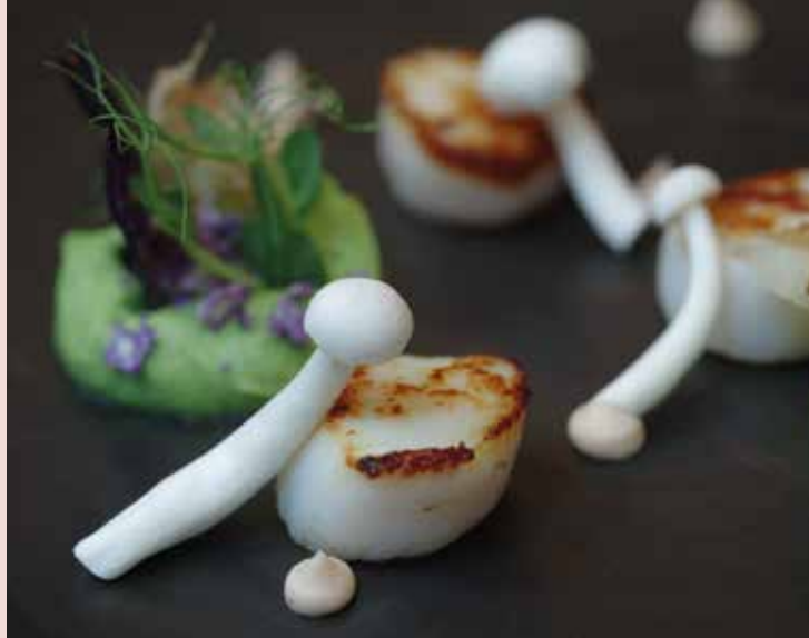
Gourmet scallops at L'Essentiel restaurant.