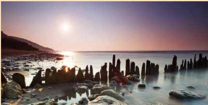
View of the old barriers - Photo by Julien Boisard.