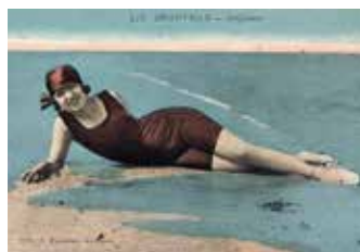
Woman bathing on the Deauville beach at the beginning of the century.

THALASSO DEAUVILLE BY ALGOTHERM 3 rue Sem, 14800 DEAUVILLE, Phone: +33 (0) 2 31 87 72 00 2- to 5-day treatments, half-day packages, à la carte treatments and access to the sport club (including longe- coast and Nordic walking).