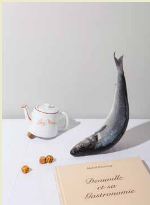
«Gastronomie» series by Audrey Corregan for the Planches Contact festival (2013).

LE VILLAGE FROMAGER -FROMAGERIE GRAINDORGE 42 rue du Général Leclerc, 14140 LIVAROT-PAYS- D'AUGE, Phone: +33 (0) 2 31 48 20 10 Guided tour of the cheese dairy with tasting, cheese bar (in summer).